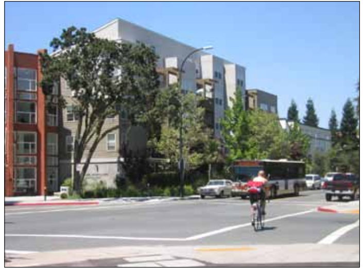
Typical traffic conditions surrounding a compact affordable housing development across from the Pleasant Hill BART station in Contra Costa County.

In the Bay Area people who both live and work within a half mile of transit are ten times more likely to use transit.